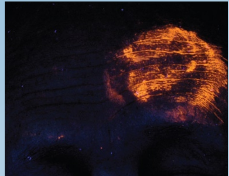
Clarisonic sonic cleansing